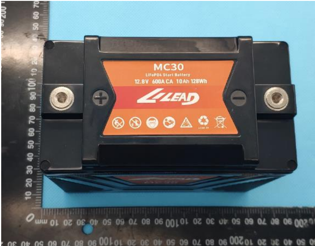
Samples /样品 (MC30 12.8V 10Ah 128Wh)